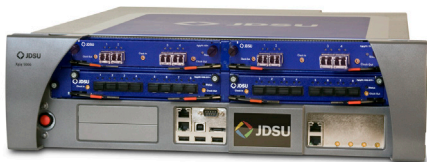
Cascading of multiple blade chassis allows for high-density time synchronous domains.