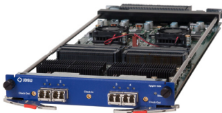
Modular blade technology allows for quick reconfiguration of chassis.